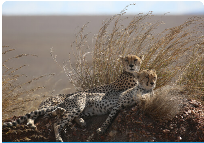
Serengeti National Park

The day that awaits you in Ngorongoro Crater will be filled with wildlife and the sheer wonder of exploring an unusual world as picturesque as any safari park in Africa